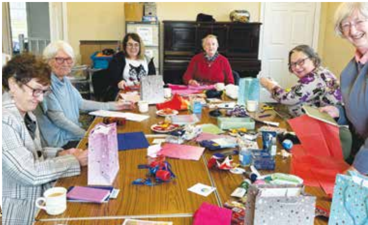
Doncaster Minster MU making their first JOY bags at their April meeting.

St Francis Branch hold monthly Soup Lunches in the church Cafe, which are very popular. Donations are for MU projects.