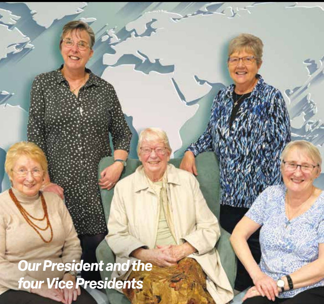
Our President and the four Vice Presidents