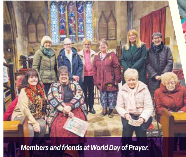
Members and friends at World Day of Prayer.