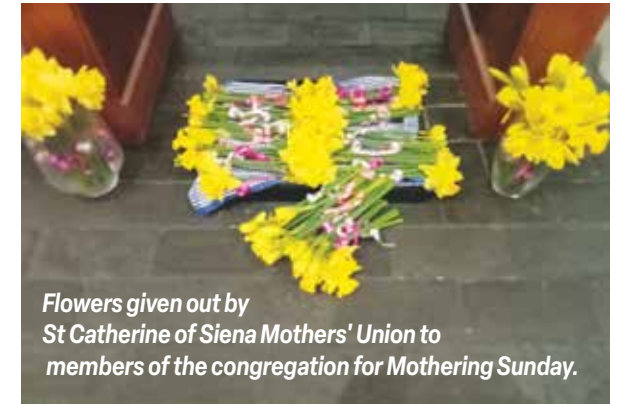
Flowers given out by St Catherine of Siena Mothers' Union to members of the congregation for Mothering Sunday.