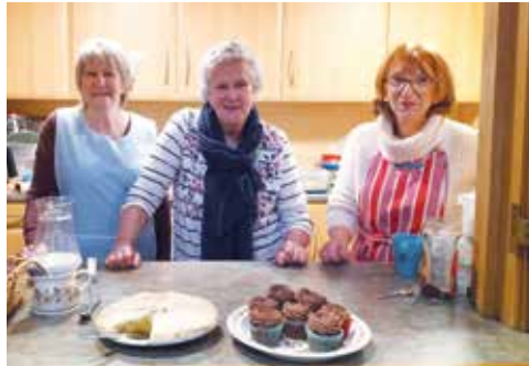
On the 23rd March, St. Mary's held a coffee morning with a Bring and Buy Stall for the "Gift of Dignity" appeal, which raised £364. It was a lovely community event which everyone enjoyed, socialising, whilst having delicious cake.