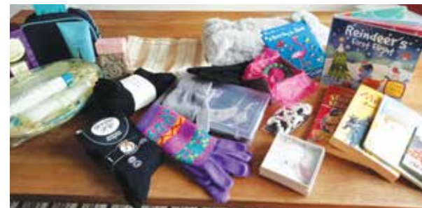
Children's books and Christmas gifts for Sheffield Refuge from St James Woodhouse MU