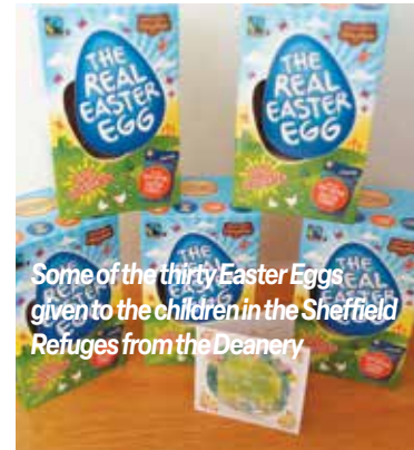
Some of the thirty Easter Eggs given to the children in the Sheffield Refuges from the Deanery