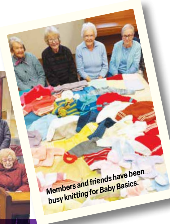
Members and friends have been busy knitting for Baby Basics.