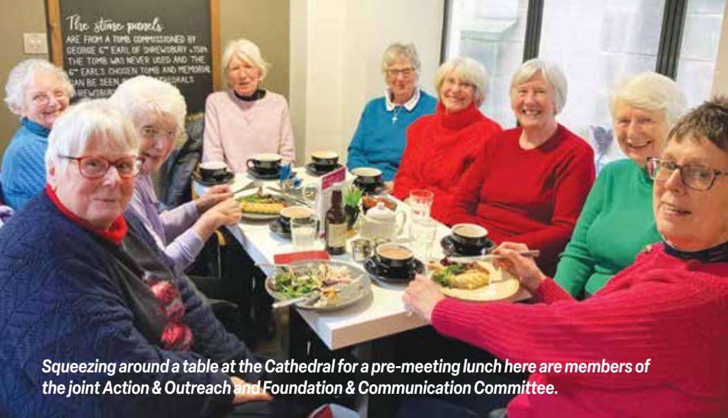
Squeezing around a table at the Cathedral for a pre-meeting lunch here are members of the joint Action & Outreach and Foundation & Communication Committee.