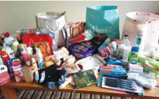
Christmas gifts and toiletries for Sheffield Refuge from Ecclesfield MU and Ladies Group.