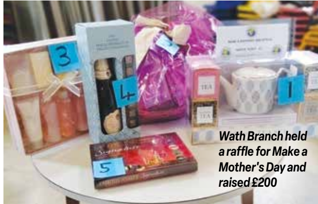
Wath Branch held a raffle for Make a Mother's Day and raised £200

Snack time at 2 with juicy fruit and a drink. Who will give out the plates? Jakob I think.