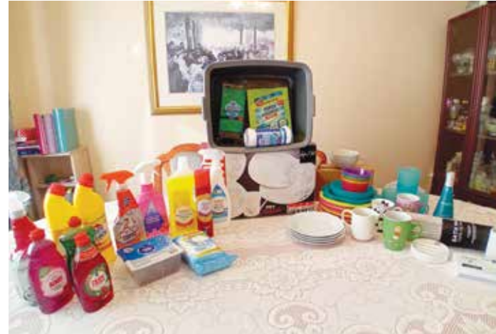
Wombwell members donated lots of items to Barnsley Women's Refuge. We focused on things needed when they leave the refuge and set up home on their own. Donations include cleaning products, crockery and plastic plates and bowls etc for children to use.